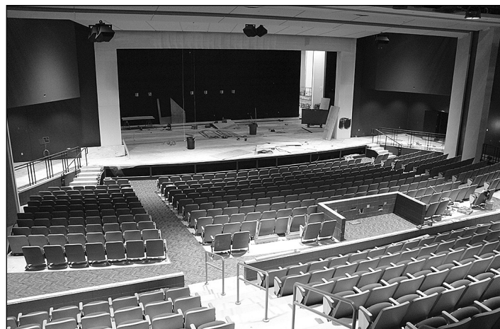
The 650-seat Performing Arts Center is nearly complete.

For more information, see bit.ly/DelanoMCA .