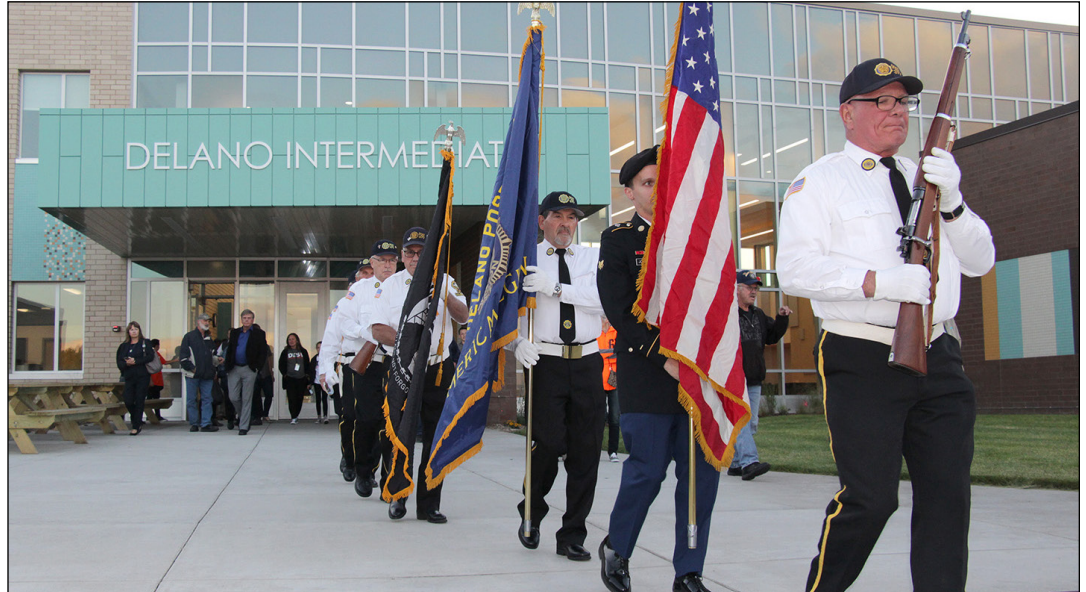
Members of the Delano Legion conducted a flag-raising ceremony prior to a public open house and ribbon cutting at Delano Intermediate School on Sept. 25.

Community members are welcome to attend the annual Veterans Day program at 9:30 a.m. Monday, Nov. 12, in the Tiger Activity Center. A shuttle bus will depart from the Legion to the school at 8:55 a.m.