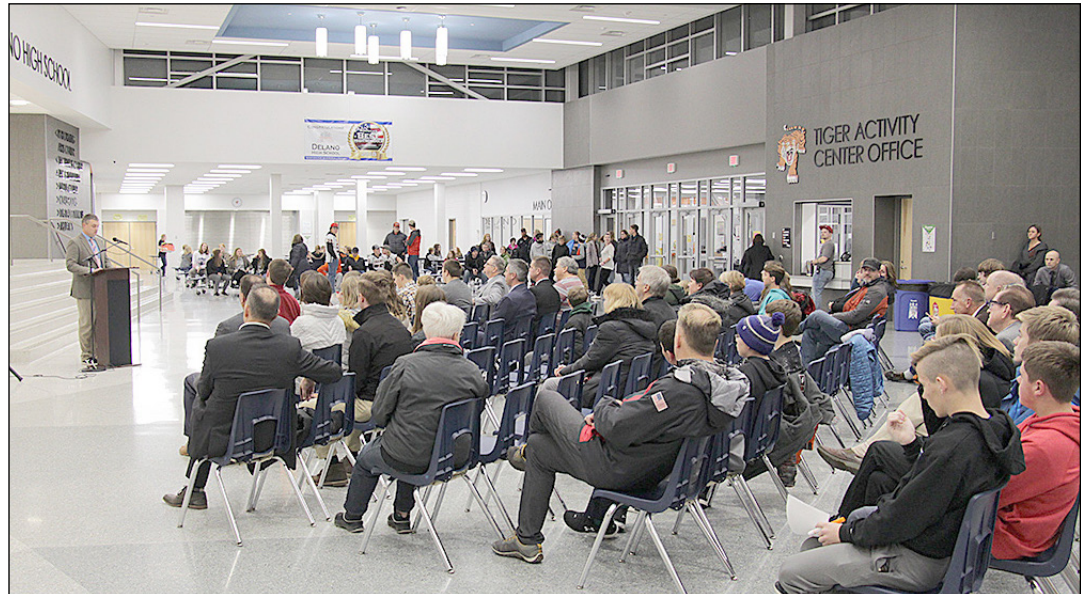
Students and community members attended a grand opening ceremony for the high school on Nov. 8, just prior to the first event in the new Performing Arts Center.

See Page 3 for the story about an innovative town deputy office at DHS that is attracting statewide attention.