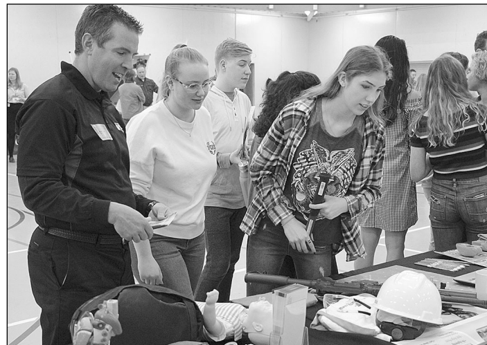
Students look over displays from the Wright Technical Center during SciTech on April 9.

As an example of the opportunities at the site, Heil pointed out that several students who had expressed interest in trades were connected with a construction business offering a three-week summer course in carpentry, plumbing and the