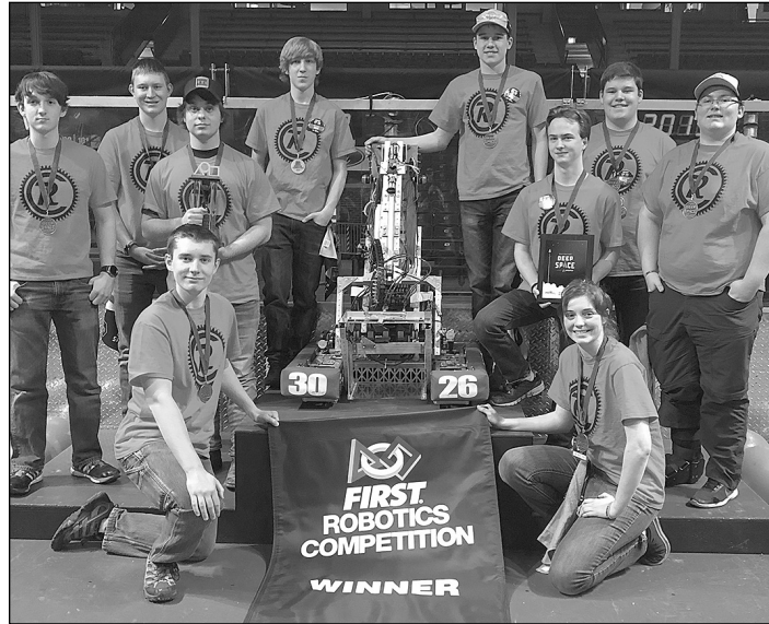
The Orange Crush robotics team celebrates the first regional championship in the program's 10-year history.