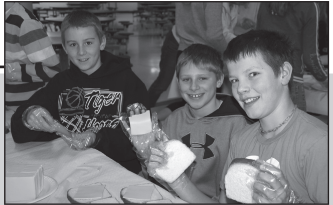
Students make sandwiches for the homeless

During the morning of December 13, 2013, Delano Middle School students and staff recognized the needs of others in the community and experienced an important lesson in life; give a helping hand where you can. Students shared goodwill towards others by participating in purposeful and structured activities. This is the 3rd Annual Global Outreach Project and this event will continue for years to come.