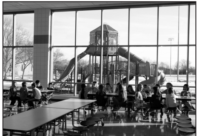
View from the existing cafeteria space to the new added space and playground area.