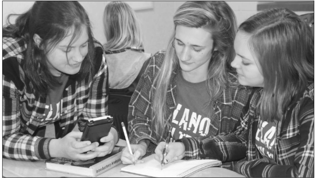
Delano students substantially exceeded state averages in the two major tests.

The science and reading scores also marked Delano's highest proficiency rates since