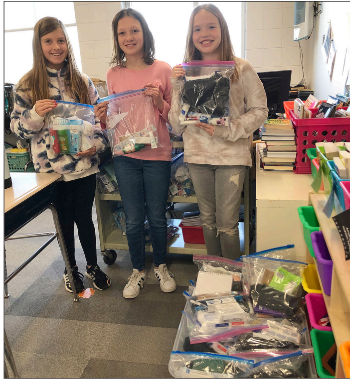
Students display some of the items gathered in last year's drive to support veterans.

The Eagles Healing Nest has recently expanded its program to include female as well as male veterans. The Nest provides holistic treatment and therapy, education and job training.