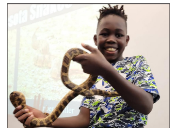
Students met some of the state's resident snakes.