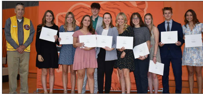
The Delano Area Scholarship Association is seeking new members to help students continue their schooling.

dents have started the process of qualifying for a scholarship by taking part in our fundraising. Later this spring, each student will complete an application highlighting their school, community and work