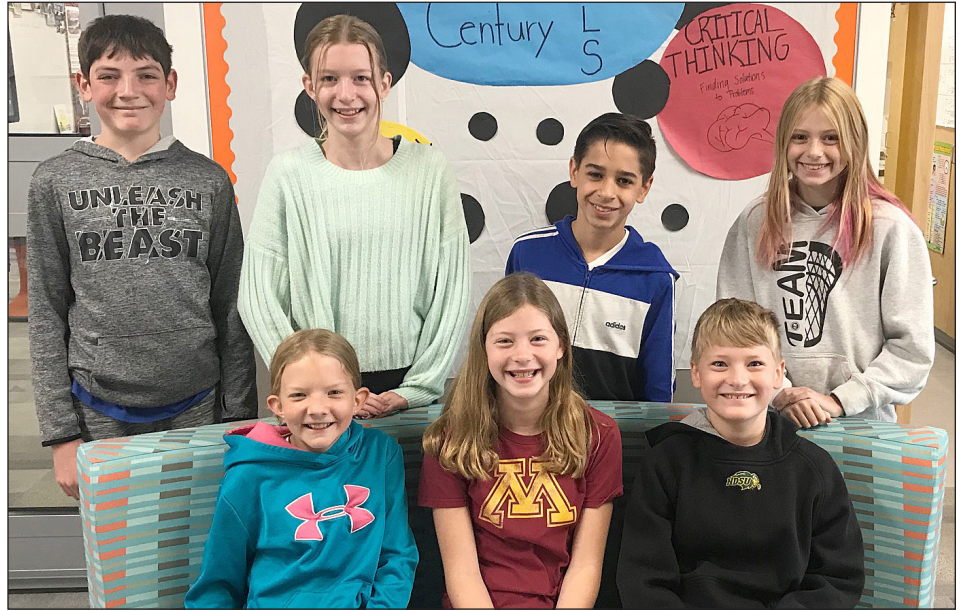
Student Council representatives currently come from fifth and sixth grade, and fourth-graders will be invited to apply in November.

The Student Council will also play a role in Unity Day by planning and hosting a Kindness and Positivity Project. All students are invited to visit the Kindness Cove table in the commons area before school on Monday, Oct. 11; Tuesday, Oct. 12; and Wednesday, Oct. 13, to design a kindness shape. All completed kindness shapes will be displayed in the DIS Commons for all