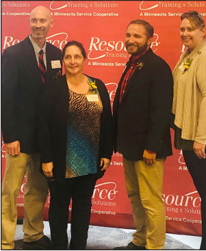
Four Delano educators have earned leadership awards. See Page 3.