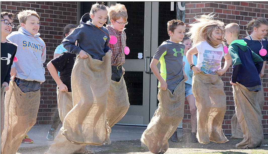
Students participated in pioneer games like sack races during homesteading week.