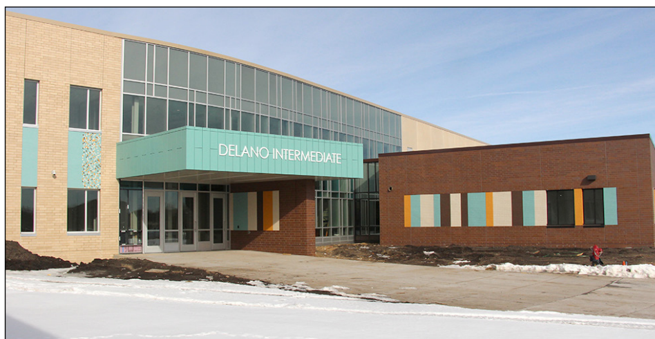
Contractors are putting the finishing touches on the intermediate school, and staff plan to start moving in the day after school ends in May.

Those unable to attend will still have access to the information through the school website. A slideshow and audio recording from the meeting will be posted.