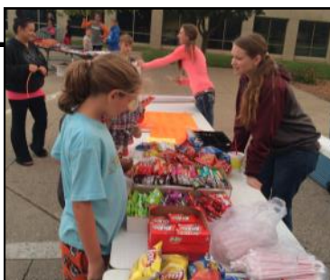
DES Outside Movie Night

After School Snack Program _____ Box Tops for Education _____ Cafeteria Friendly Presence _____ Coborn's Labels for Learning _____ Commencement Day Help _____ (Jr. Parents) _____ DI Team Manager _____ DHS PIE _____ Drama Assistant _____ Friendly Presence _____ Hearing & Vision Screening (Gr. 10) _____ _____ HS Site Base Team _____ Lunch Server _____ Media Center Helper _____ Motivational Speaker _____ Prom Events Help _____ Red Cross Blood Drive _____ Talent Development Assistant _____ Use me as a resource _____ (eg. profession, hobbies, travel, languages) Volunteer On Call _____ Youth As Resources Board Member _____