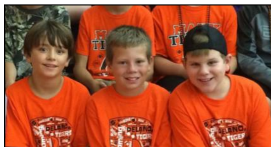
Middle School Homecoming Fun!