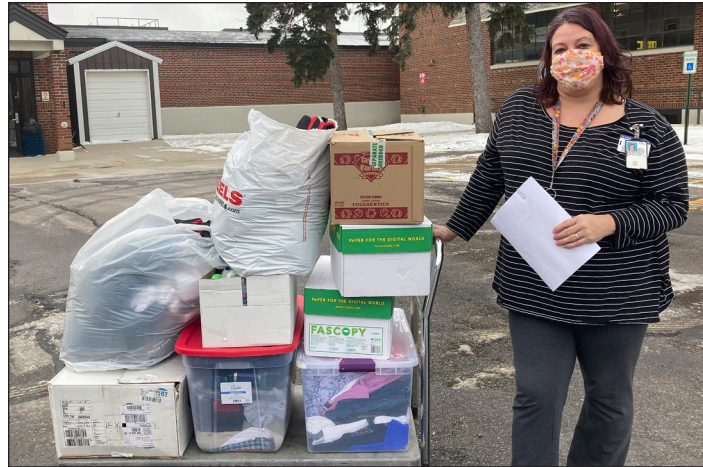
Some of the Delano donations from a previous year are dropped off at a VA hospital.

The past 18 months have been challenging for all of us, but especially for veterans with mental health needs. With your