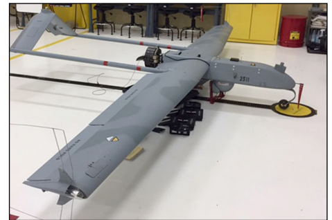
Students examined drones large and small at Camp Ripley.

"They can go over to Buffalo and do their ground courses for only about $200, so it's cheap at first," said Monke. "That gets them entry-level, but then they have to start paying for flight time and in-