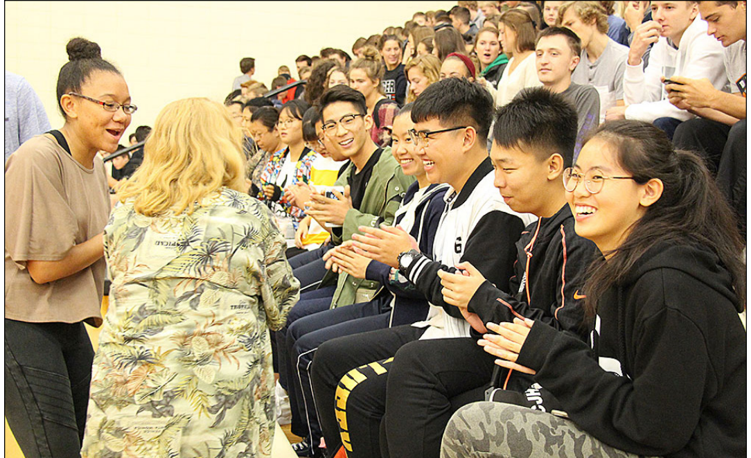
Eight Chinese students enjoy a pep fest in their honor on Monday, Sept. 25.

"It gives them a much deeper understanding of a part of the world they might have had preconceived notions about, and I think they really realize how fortunate they are."