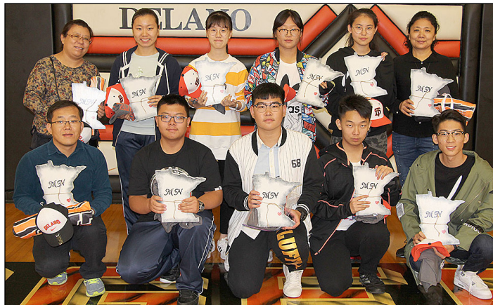
Three teachers and eight students received gifts during their welcome ceremony at DHS.