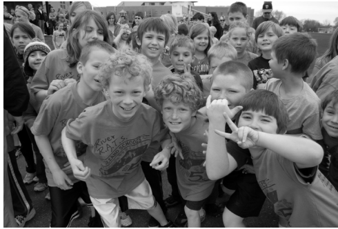
DES kids get ready for the one mile Fun Run!

Delano Public Schools staff, students and parents participated in the inaugural River R.A.T.S. "Really Active Teachers and Students" 5K Walk/Run/Roll, on Wednesday, April 13, 2011. This was a district wide event which involved a 12-week training program for those individuals who needed a jump start. Each school, from the elementary to high school, promoted this event with exercise incentives, healthy eating tips and prize drawings for the participants. 110 teachers and staff members participated in the 5K Run/Walk/Roll event. Before the 5K event, Delano Elementary School wanted to promote health and wellness to their kids, so 150 kids and parents hit the road running in a one mile fun run.