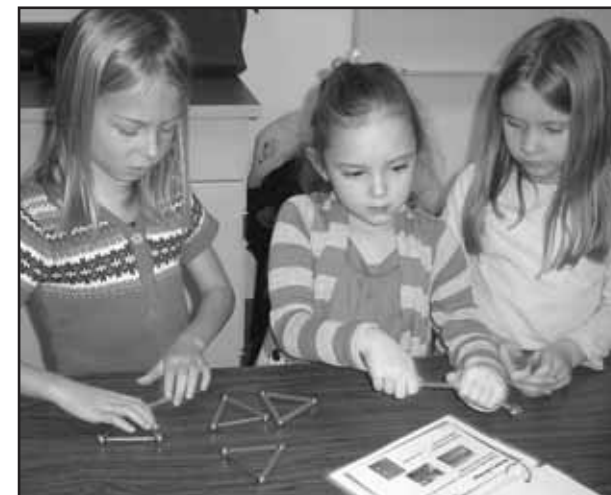
The Works, a hands-on, minds-on museum about engineering, science and technology came to DES