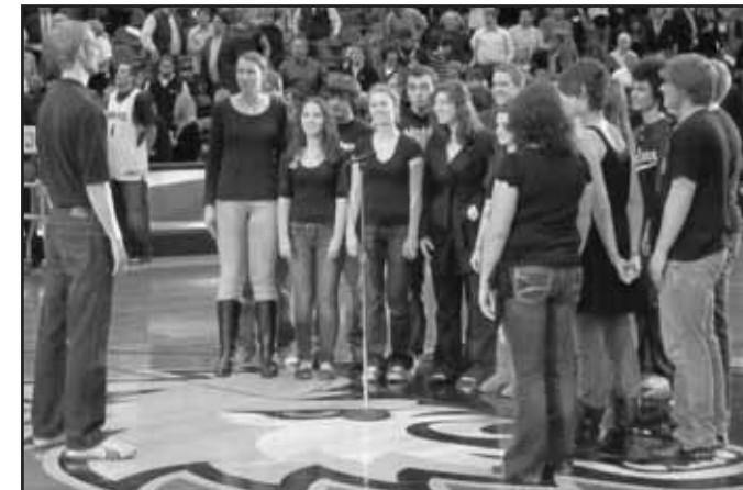
Sound Revolution, a DHS singing group, performed at a Timberwolves game