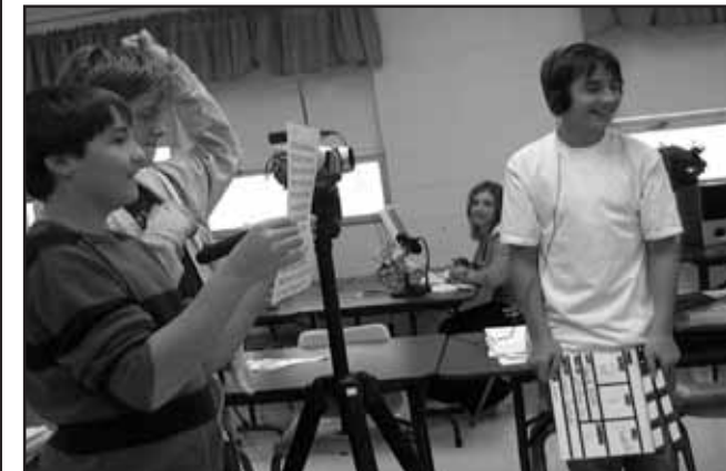
The GROWL is a monthly news magazine created by students at Delano Middle School