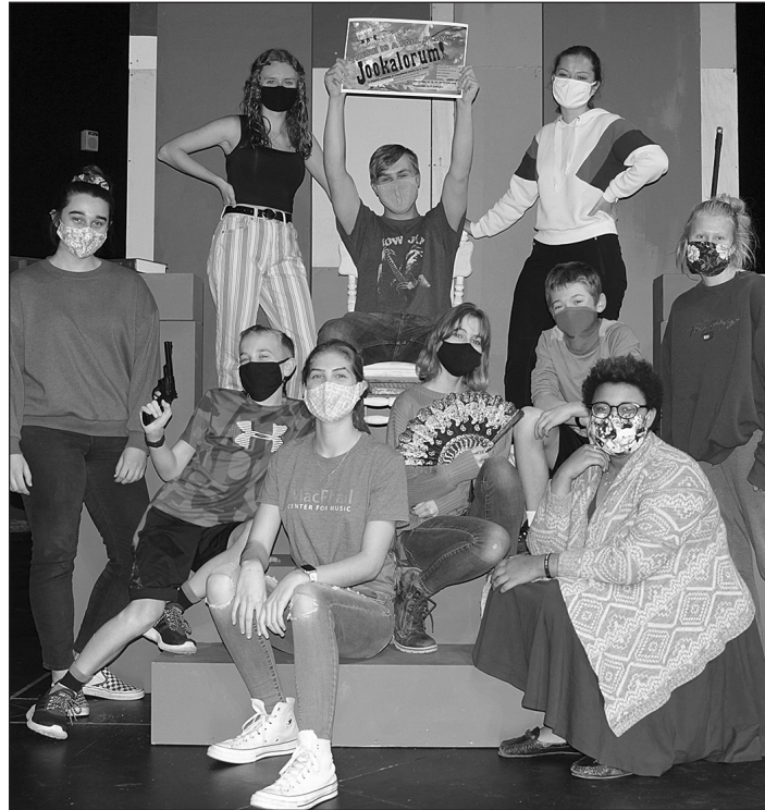
A small cast has been rehearsing virtually, for the most part, to present a selection of O. Henry's short stories.