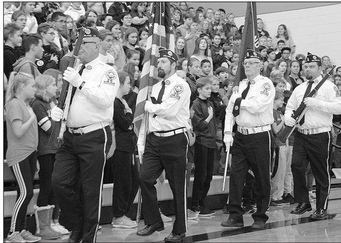
Members of the Delano American Legion enter the Tiger Activity Center during last year's Veterans Day event.

Take a Veteran to School Day aims to connect veterans