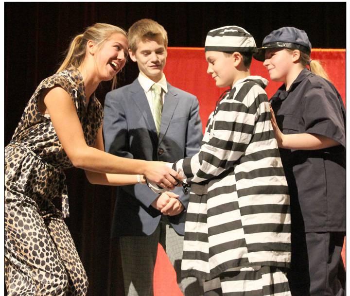
The Junior High One Act included a broad cast of characters for a play-within-a-play.

preparing for the Minnesota State High School League one act season, which kicks off with a five-school festival at Delano on Saturday, Jan. 20.