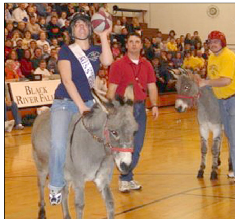
Students and staff will square off in donkey ball on Saturday, Jan. 6.