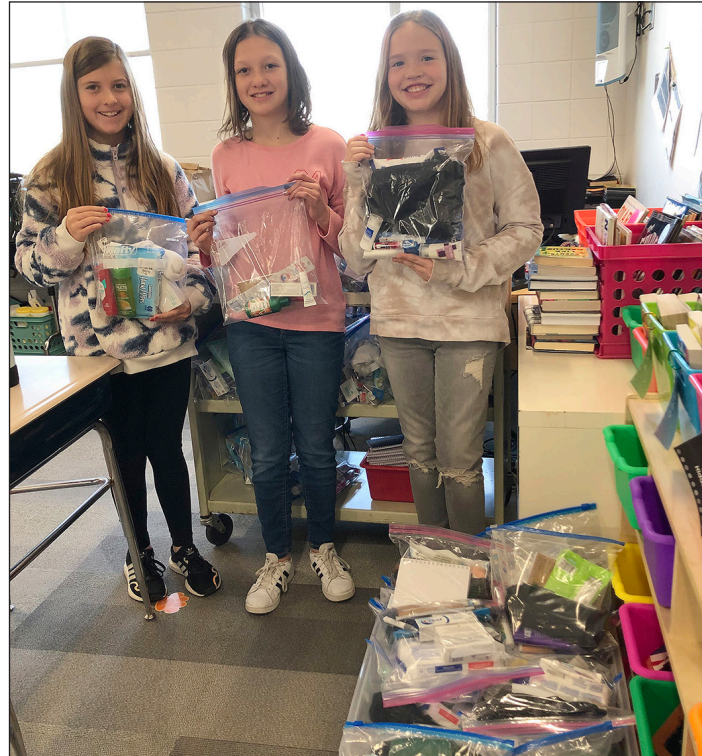
Students display some of the items gathered in last year's drive to support veterans.

The Eagles Healing Nest has recently expanded its program to include female as well as male veterans. The Nest provides holistic treatment and therapy, education and job training.