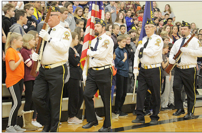
Members of the Delano American Legion enter the Tiger Activity Center during last year's Veterans Day event.