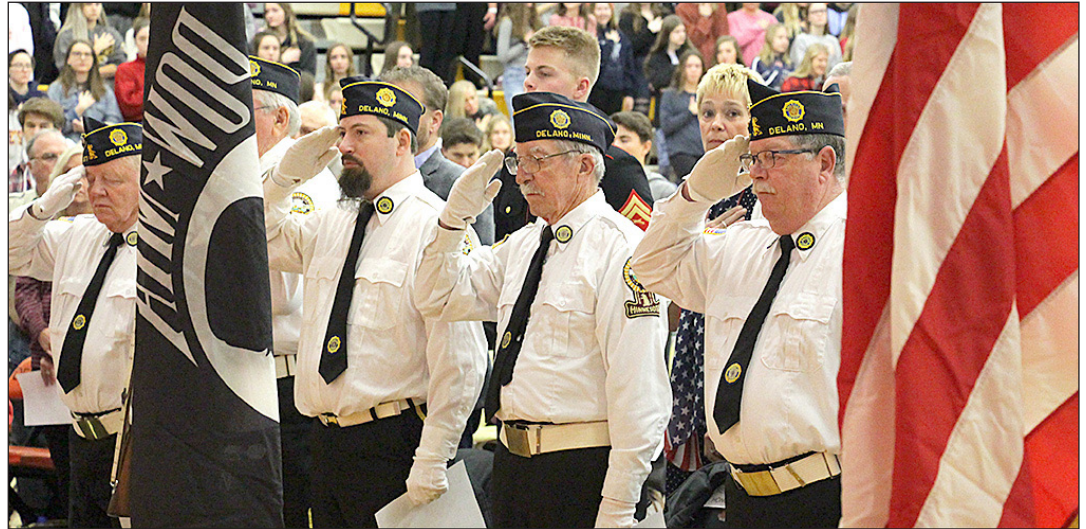
Members of the Delano American Legion salute after posting the colors to open the annual Veterans Day program.

"Often, veterans feel isolated because their sacrifice is