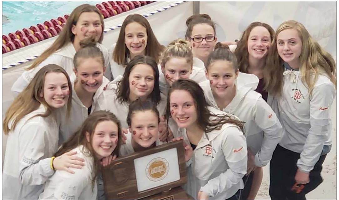
Members of the girls swim and dive team celebrate their third place finish at the Class A state meet on Saturday, Nov. 16.