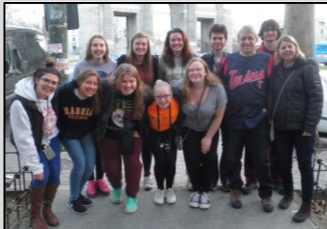
Students at DHS travelled to Spain this winter and experienced Spanish culture by living with host families during their visit.

LAST DAY OF SCHOOL Is Wednesday, May 24!