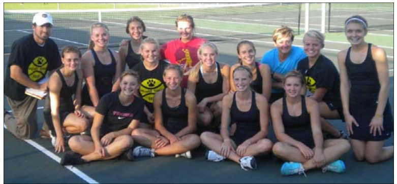
Congratulations to the DHS Tennis Team for winning their 5th consecutive Wright County Conference!